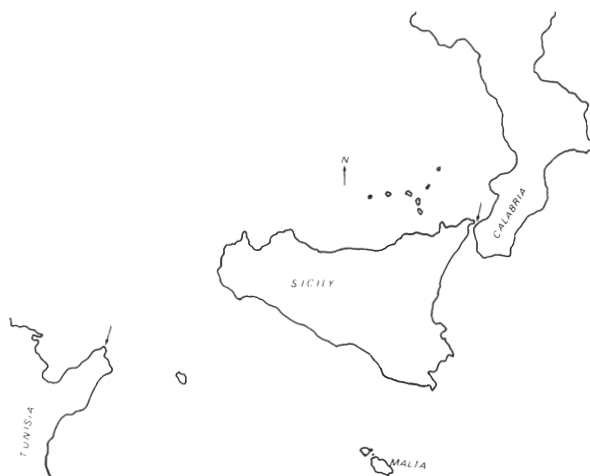
Fig. 1: The study area.

possible to identify individuals, thanks to particular features of their plumage (broken or missing remiges and/or rectrices) or entire flocks, through particular interspecific associations, transit again over our observation posts after an hour or, in the case of the former, repeatedly over several days and thereby avoid recounting the birds. Individuals were seen returning to the coast after disappearing over the sea. Finally flocks with numerous individuals were seen leaving the coast in a NE direction much farther south than our observation post, but because of the distance it was impossible to identify the species or count the individuals.