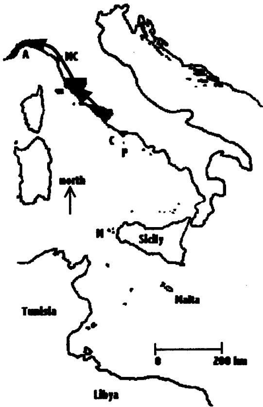
Figure 1. The study area (A = Arenzano, MC = Mount Colegno, C = Circeo promontory, P = Ponza, M = Marettimo; the breeding areas of the Short-toed Eagle in the Ligurian Apennines and central Italy are shown in gray).

probably winter in Sicily (Mascara 1985, Cattaneo and Petretti 1992, Cattaneo 1997, Agostini and Logozzo 1997). In the Mediterranean basin, the greatest concentration of individuals has been observed at the Strait of Gibraltar both during autumn and spring movements (Finlayson 1992).