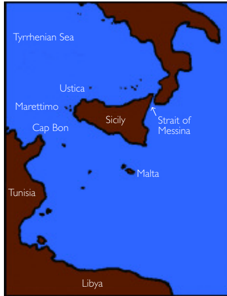
Fig. 1. Map showing the position of Ustica, and other key raptor migration watchpoints in the central Mediterranean.

Each spring, thousands of raptors cross the Mediterranean Sea between Africa and southern Italy during their northward migration to European breeding areas. Within this region, the largest concentrations have been reported at the Strait of Messina, between southern mainland Italy and Sicily (fig. 1). Corso (2001) documented an average of 26,062 raptors migrating across the Strait of Messina each spring between 1996 and 2000 (table 1). At this site, raptors crossing the Strait of Sicily, between the Cap Bon peninsula and western Sicily, converge with those migrating north