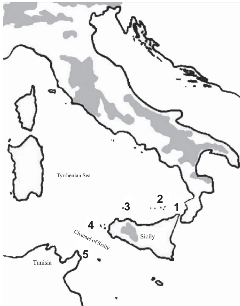
Fig. 1. Locations mentioned in the text (study sites in bold): 1 – Strait of Messina , 2 – Panarea and the Eolian islands, 3 – Ustica island , 4 – Marettimo island, 5 – Cap Bon Promontory. In grey – the main breeding grounds of Black Kites in central-southern Italy (Sergio 2002, Sarà 2003).

reached the coastline, Black Kites were more likely to stop migration (not crossing the sea and roosting at the site) rather than to cross the water (Table 1; \chi^2 = 7.8 , df = 1 , p < 0.01 ). A flock of 8 individuals was seen hunting and staying on the island for six days. In 35 cases, with a total of 105 individuals, we observed Black Kites reaching the coastline and then flying back inland. In 3 cases (for a total of 28 individuals) it was not possible to follow their movements. Finally, 179 Black Kites were observed disappearing over the sea toward NE, often hesitating along the coastline and in two cases crossing the water apparently following a Marsh Harrier ( Circus aeruginosus ).